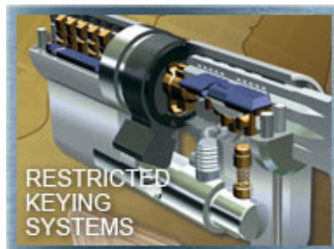
RESTRICTED KEYING SYSTEMS